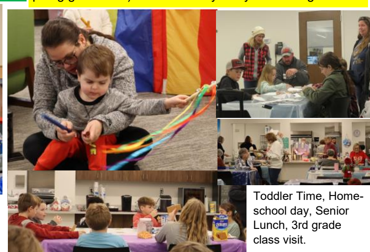
Toddler Time, Homeschool day, Senior Lunch, 3rd grade class visit.