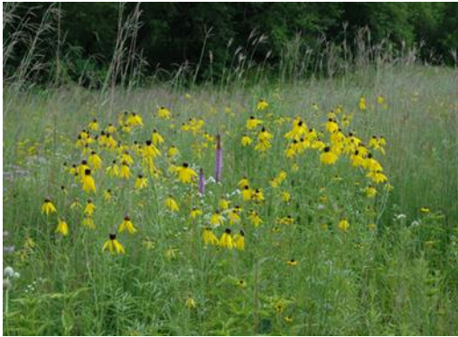
Mother Nature's Garden Betsy Betros' Prairie Remnant

Sandwiches, chips, cookies will be served in Great Room from 6 to 6:30 Please join us!