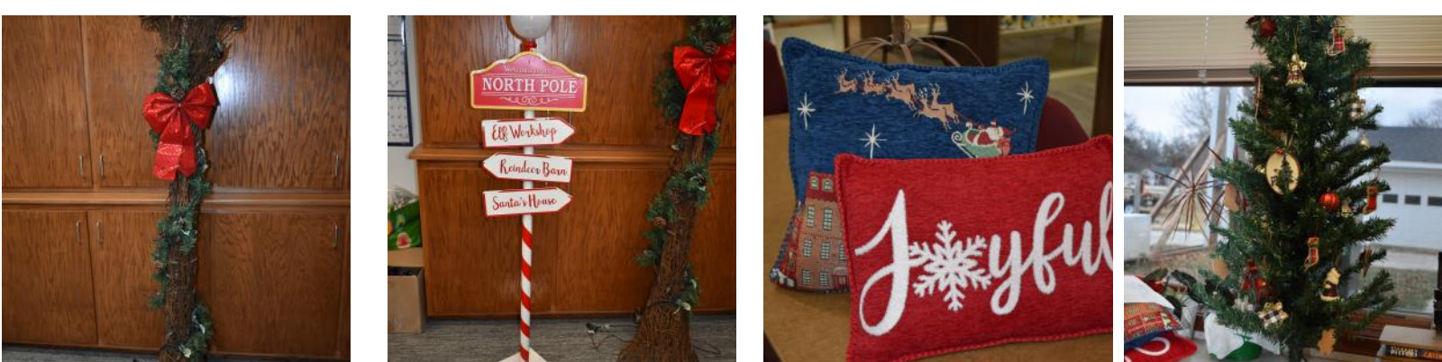
Just a few of the Christmas Raffle Items You Might Win this year!

2022 has been a busy year at the library. Things returned to more normal and we hosted a lot of programs and events. We have been asked several times if there is anything you can do to help the library. Well as the year ends, We have a “Giving Tuesday” link on Facebook https://www.facebook.com/donate/2340002679498658/ that you can make donations for the lunch program or you can drop off tax deductible donations (Friends of Library is a 501c3). You can support the Friends of Library Christmas raffle which will be on display through 4:45 PM on Dec. 11. Winners will be announced at 4:45 during Christmas on Broadway. You can buy tickets for items or donate items for the raffle. Another way to support us is to attend the dinner in the Great Room on Dec. 11 and give a FREE WILL DONATION for a meal. The lunch program is not funded by tax dollars, it is totally funded by donations from folks who believe in this program, and a occasional grant that we get (like the MFA that bought us reusable to-go containers). So as you are wrapping up the year, please keep the Friends of Library Lunch program in mind for year end giving.