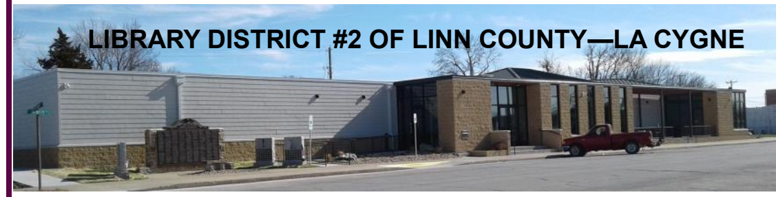
LIBRARY DISTRICT #2 OF LINN COUNTY—LA CYGNE

Serving our Community: One book, One program, One individual at a time! Check us out in 2021 with our "Tails and Tales" Programs!